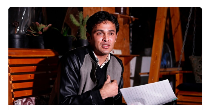
Rights Group Exposes Palestinian Torture Ahead of First UN Review - ... GENEVA, July 14, 2022 — The Palestinian Authority and Hamas routinely torture human rights activists, women, LGBT persons, political opponents, so-called "collaborators," and Palestinians who sell la...

BREAKING: The Palestinian Authority tortures human rights activists, women, LGBT persons, political opponents, so-called "collaborators," and Palestinians who sell land to Jews, UN Watch charged today, ahead of the UN's first-ever review of the PA record.