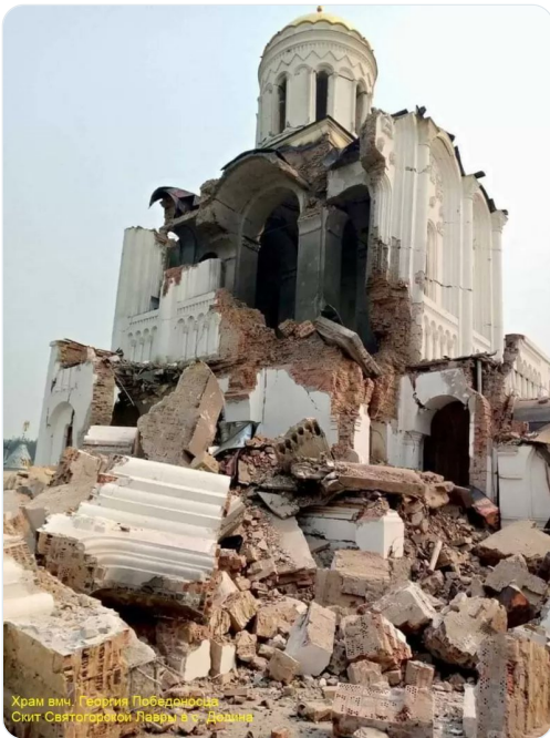
Храм вмч. Георгия Победоносца Скит Святогорской Лавры в г. Дзержинск